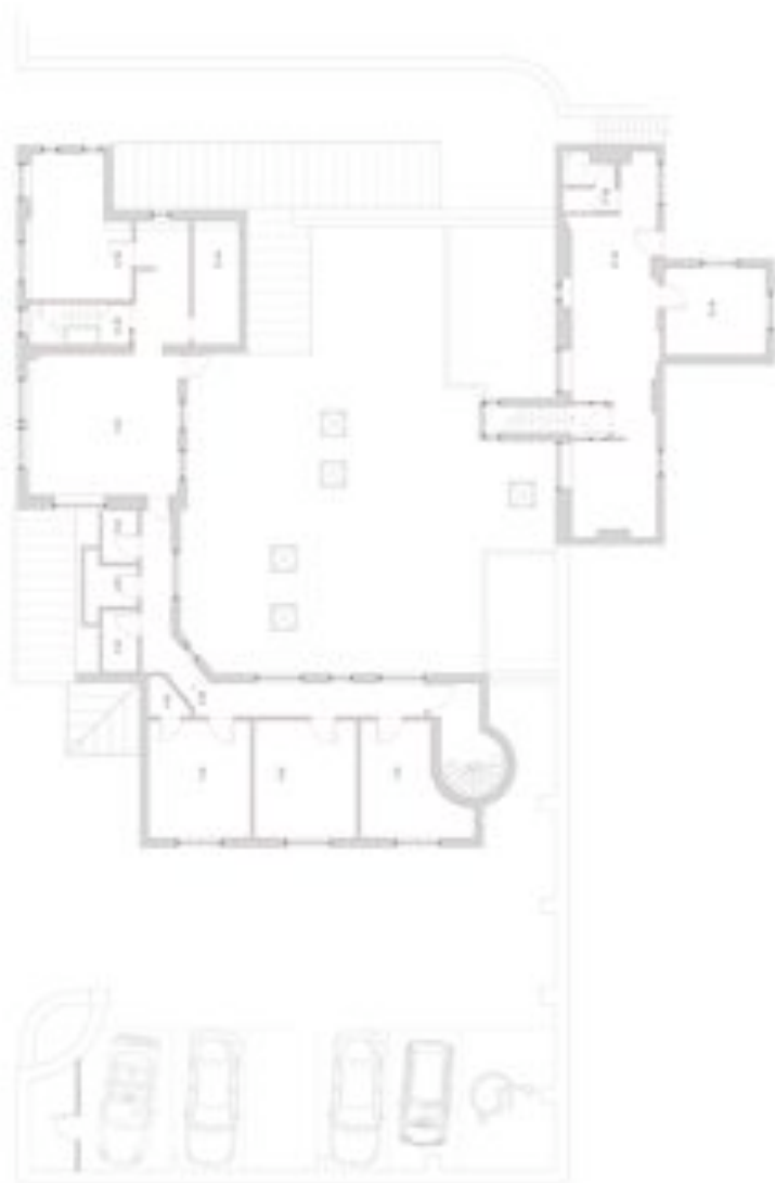
existing first floor - general arrangement