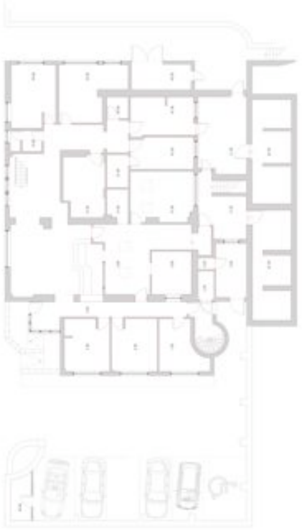
existing ground floor - general arrangement